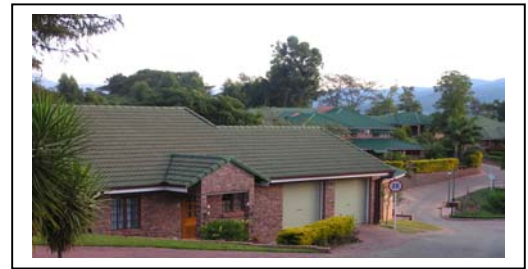
Village Street view